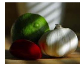
Delicacies with garlic may be a way out

Garlic can aggravate stomach ulcers. So people who are prone to stomach ulcers should avoid garlic. People who are on HIV medication saquinavir should also skip garlic.